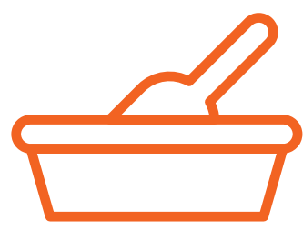
Urine, diarrhea, vomiting